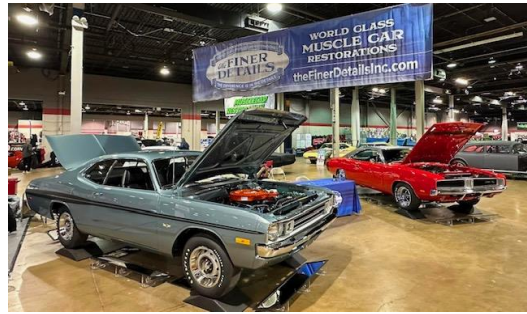
Our friends at The Finer Details, Danville IN.